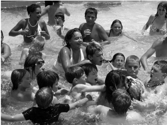
Greased watermelon contest

For more information on joining the pool go to www.eastashevillepool.com