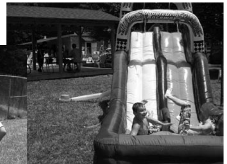
Splash and crash