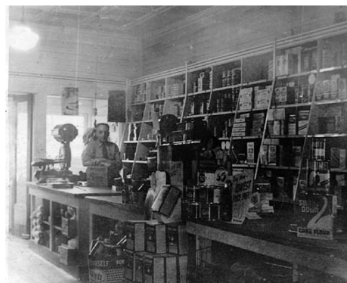
View inside the Miller store.

The original Millers Store, today the home of Dalton Carpet, was