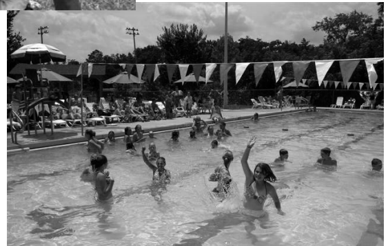
Staying cool in the pool