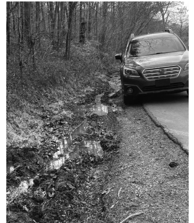
Current parking at Masters Park

Look for the "Make Donation" button at the homepage bottom. By mail, please send donation checks to HCCA at PO Box 9193, Asheville NC 28815