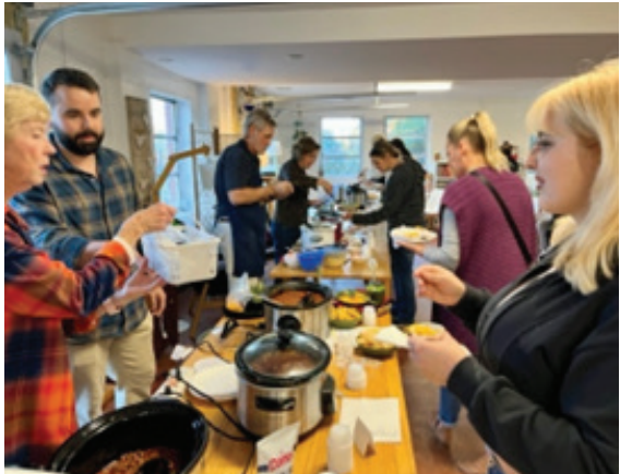
HCCA's Chili Cook Off in October brought neighbors together to share community spirit.

Haw Creek Community Association PO Box 9193 Asheville, NC 28815