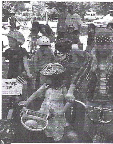
Riders line up for the start of the Parade.

The second annual Children's Bicycle Parade was attended by over 30 kids and their parents on Memorial Day. For a few hours Haw Creek Park was transformed into a patriotic wonderland. Kids decorated their bikes in red, white and blue and then paraded before a team of judges comprised of 1 active army soldier and 2 retired soldiers.