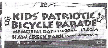
A great banner made for this years parade.

While the judges were deliberating over who had the most patriotic bike and a myriad of other awards, kids and parents were treated to cold lemonade and cookies. Some parents expressed their thanks for "such a fun, safe, kid-oriented event." Many of your neighbors volunteered their time and energy to make this event a great success. Their hard work is appreciated. If